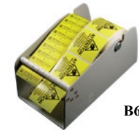
B6702 Label dispenser